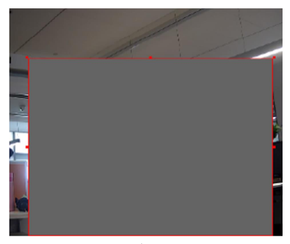
Figure 4-1 Set Video Tampering Area