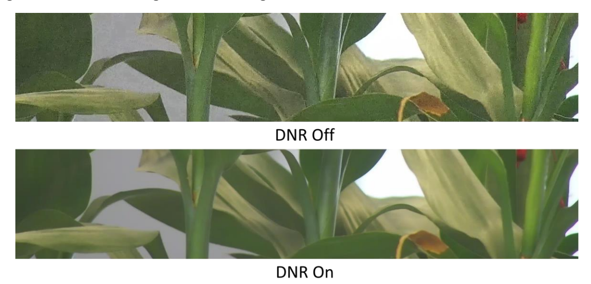
Figure 7-2 DNR

Set the DNR level for both space DNR and time DNR to control the noise reduction degree. The higher level means stronger reduction degree.