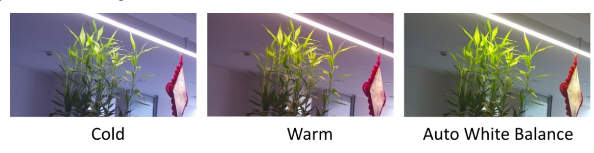
Figure 7-1 White Balance

temperature according to the environment.